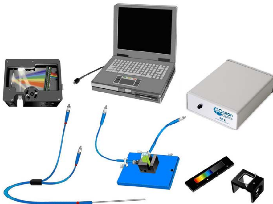
Ocean Optics USB2000+ Fiber Optic Spectrometer Typical Set-up

The USB2000+ Spectrometer connects to a computer via the USB port or serial port. When connected through a USB 2.0 or 1.1, the spectrometer draws power from the host computer, eliminating the need for an external power supply. The USB2000+, like all USB devices, can be controlled by our OceanView software, a Java-based spectroscopy software platform that operates on Windows, Macintosh and Linux operating systems.